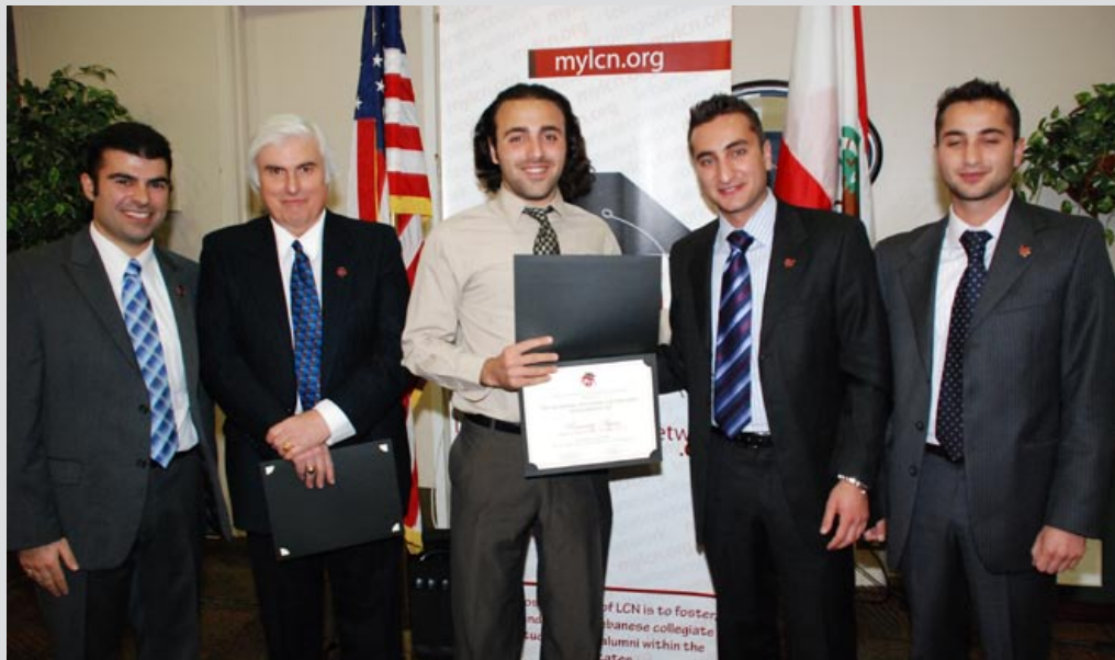
The Lebanese Collegiate Network (LCN) Academic Excellence & Heritage Award recognizes talented students who have demonstrated a remarkable academic record and have presented themselves as leaders among their peers within the Lebanese Community. This is a $1000 award.