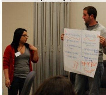
Students presenting the answers of their Group Activity question

In the ULC Group Activity Workshop, students were separated into 9 different groups. The groups were then handed a question/topic/issue that they need to work on collectively to answer. Furthermore, each group is given markers and large sheets of paper to prepare a 3