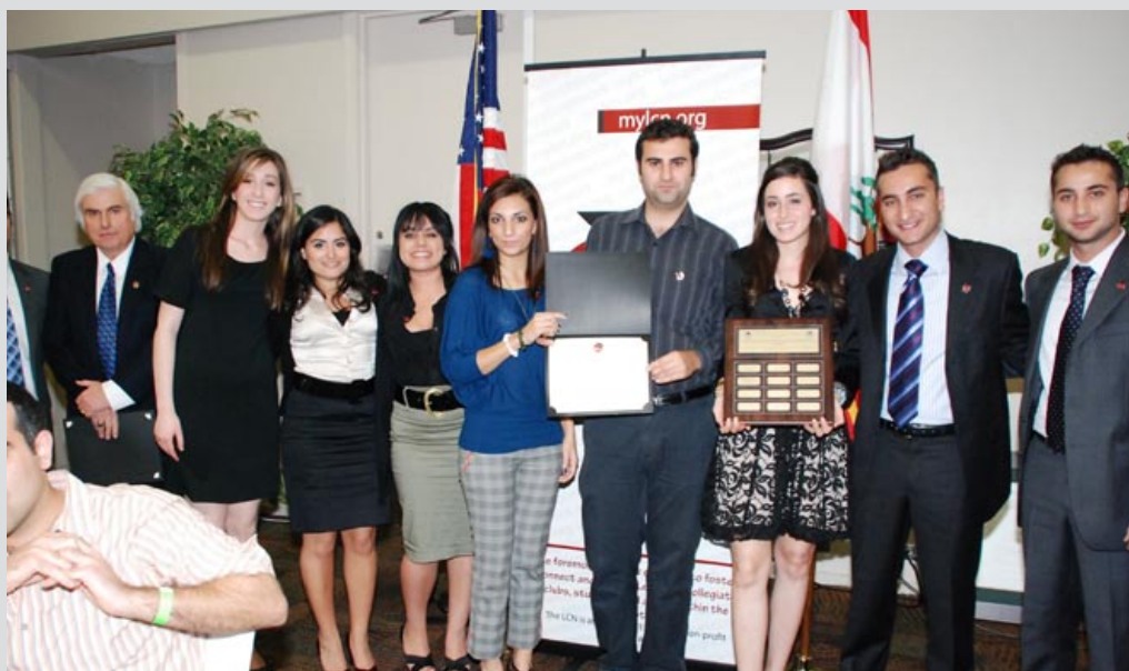
The Lebanese Collegiate Network (LCN) recognizes and honors the achievements of a University Lebanese Club (ULC) through the LCN Most Outstanding ULC Award. This prize includes a $500 monetary value and a perpetual plaque that includes an inscription of the ULC’s name.

The Lebanese Club at the University of California, Santa Barbara received the LCN “Most Outstanding ULC Award” for 2009. The Lebanese Club has demonstrated great involvement in their campus community and hosted a variety of events to raise awareness, keep its members enthused and reach out to the community. These events include a “Middle Eastern Awareness Week” that included panel discussions, movie screenings and cultural performances.