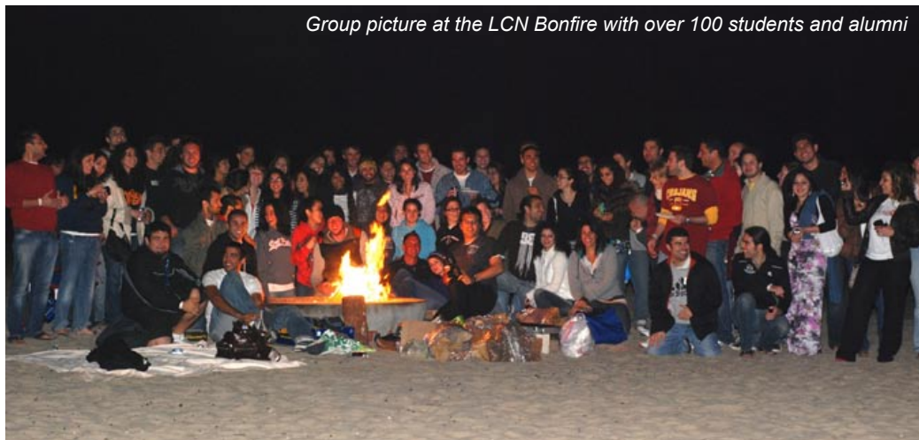
Group picture at the LCN Bonfire with over 100 students and alumni

with "We also received our tax-exempt status within 4 months. To put this into perspective, most organizations expect a response from the IRS between 6 months and a year." Patrick concluded the presentation as he began, by affirming the State of the LCN as STRONG!