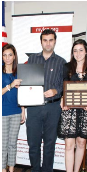
Most Outstanding ULC Award Lebanese Club at UCSB