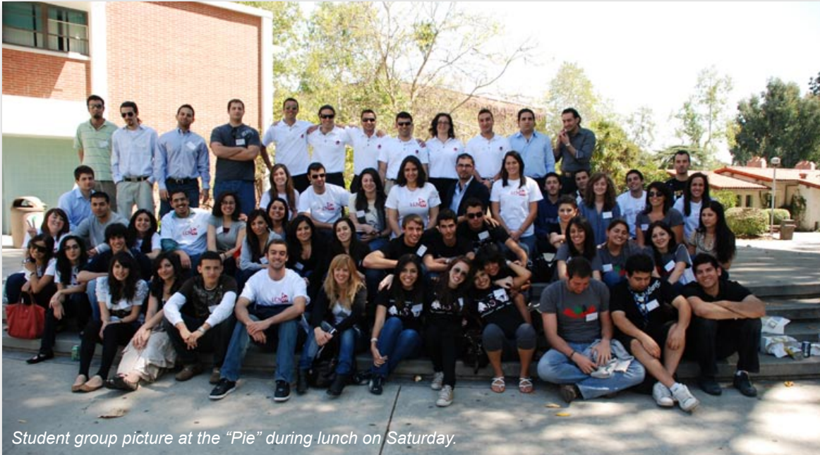
Student group picture at the "Pie" during lunch on Saturday.