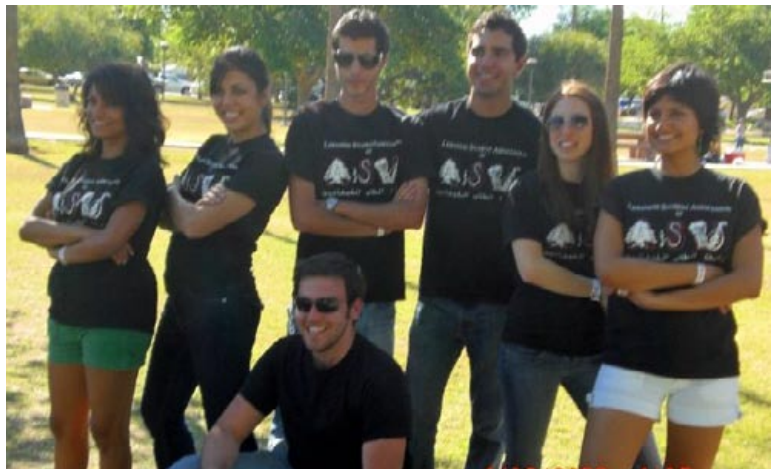
ASU Lebanese Student Association board members