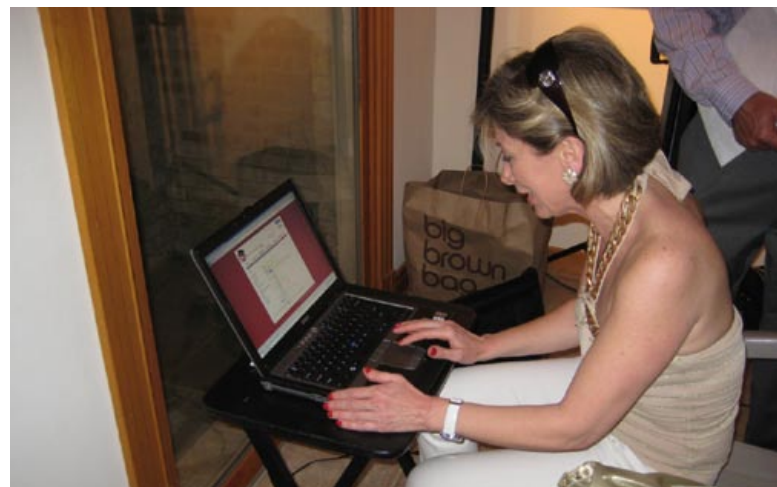
Professionals signing up on mylcn.org throughout the event