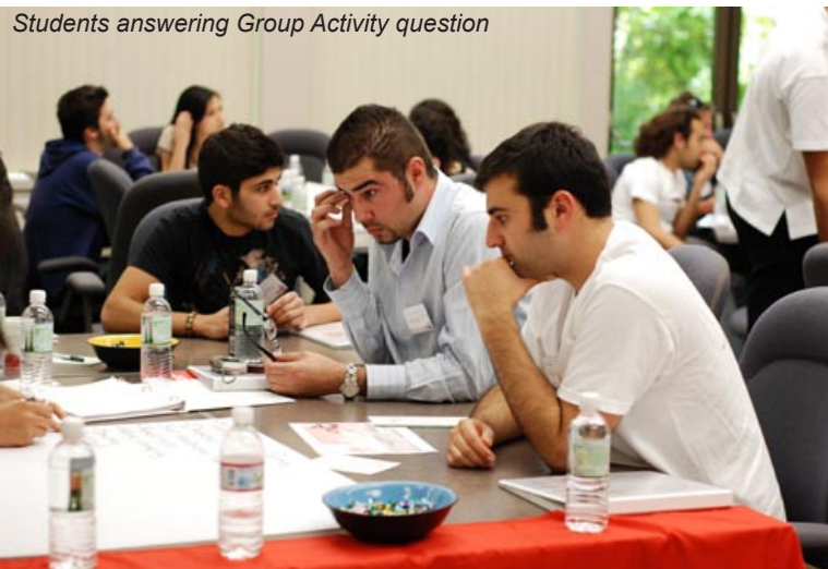
Students answering Group Activity question

to strengthen these clubs through the sharing of ideas and experiences among different clubs. Questions included: What lessons have you learned that can raise the revenue for other ULCs? What does your ULC do to attract Lebanese Students to become active in your organization? What programs does your ULC provide to help students develop academically, socially, and professionally? The answers to these questions as well pictures of the groups and presenters can be found online at mylcn.org/lcn09 .